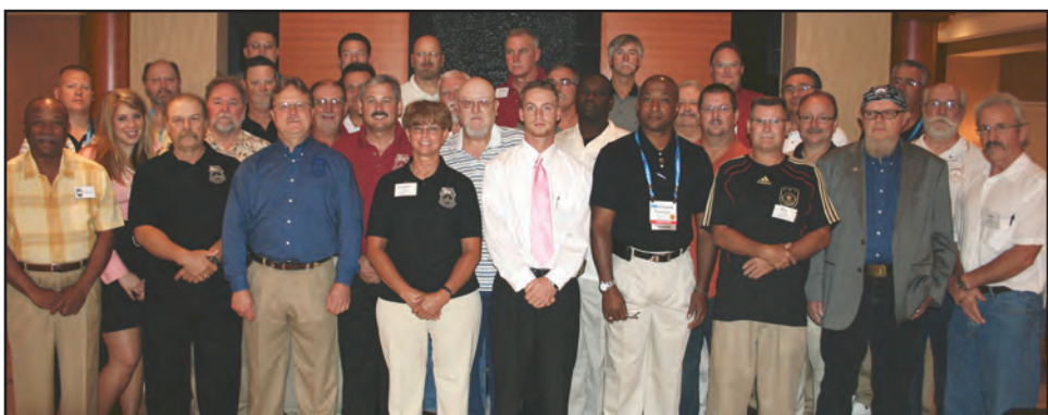
BMWED Legislative Department staff and Directors.

A large contingency of BMWED State Legislative Directors attended the meeting.