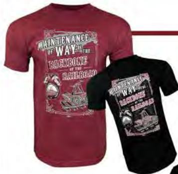
Blackbone of the railroad T-SHIRT (2 colors)