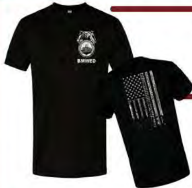
American Spike T-shirt (front & back) design