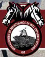
ALLIED FEDERATION LOCAL LODGE #0409