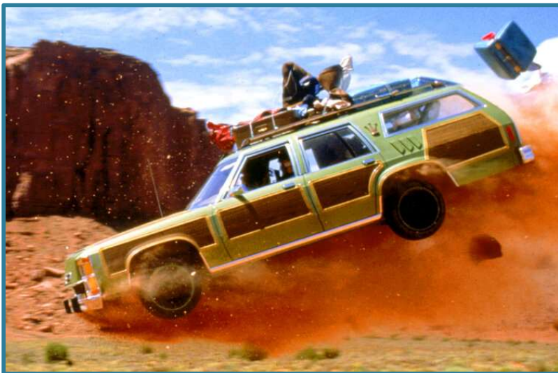
Photo from National Lampoon's Vacation . Warner Bros. 1983