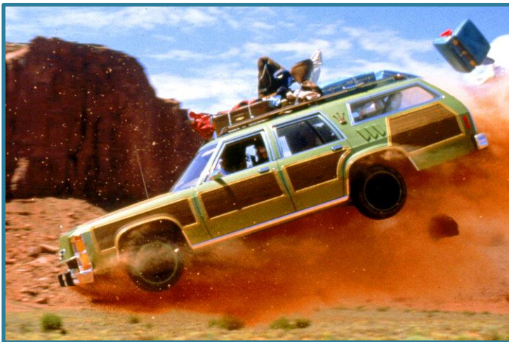
Photo from National Lampoon's Vacation . Warner Bros. 1983