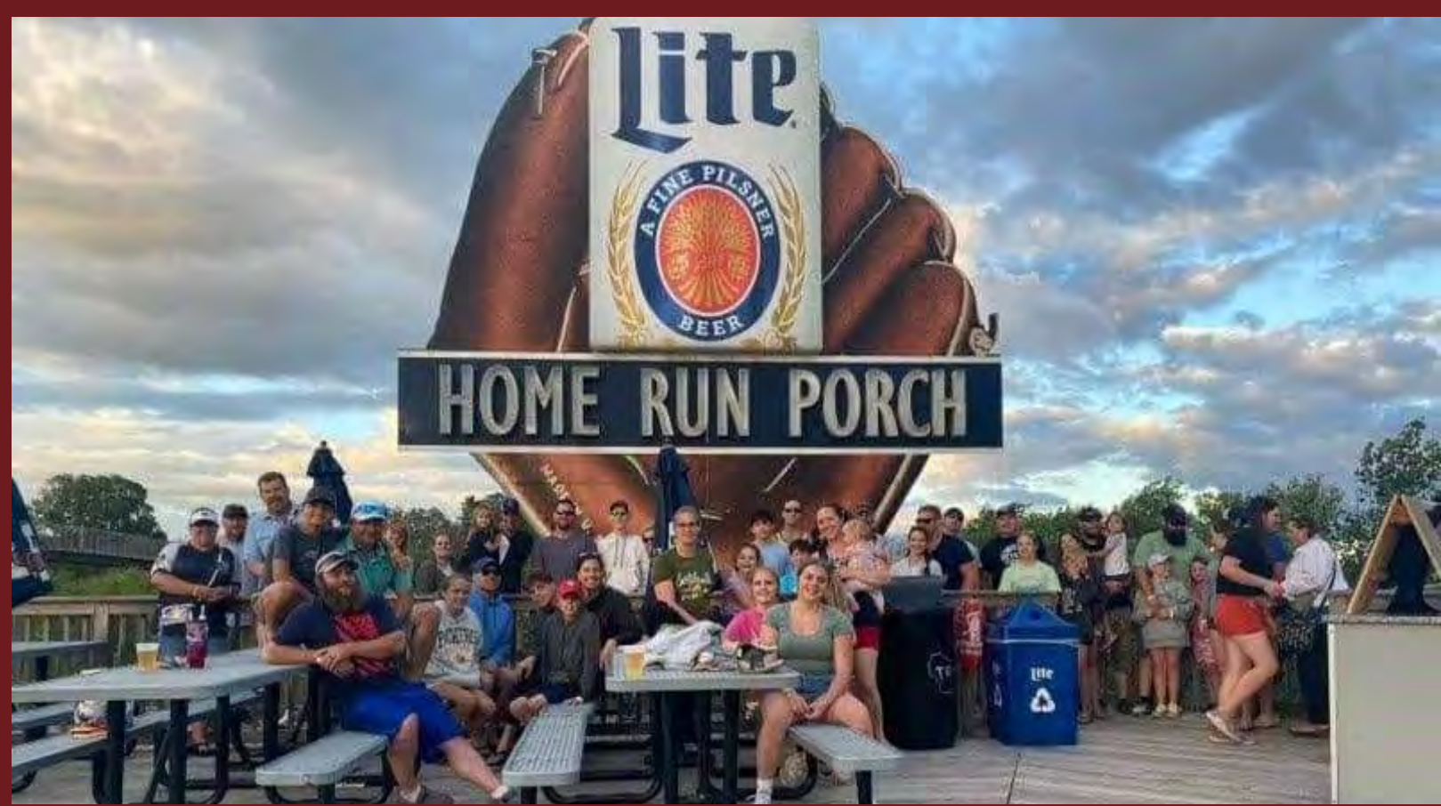
Pictured Above: Members of all three locals as well as their families were in attendance.

On June 29th, BMWED Wisconsin Central System Division Locals 2927, 2928 and 2931 rented the Home Run Deck at the Wisconsin Timber Rattlers game. The Timber Rattlers are the High-A affiliate of the Milwaukee Brewers. As of March of last year, Minor League baseball players voted to Unionize, and together with the Major League Baseball Players Association, ratified their first collective bargaining agreement. So, we are Brothers supporting Brothers.