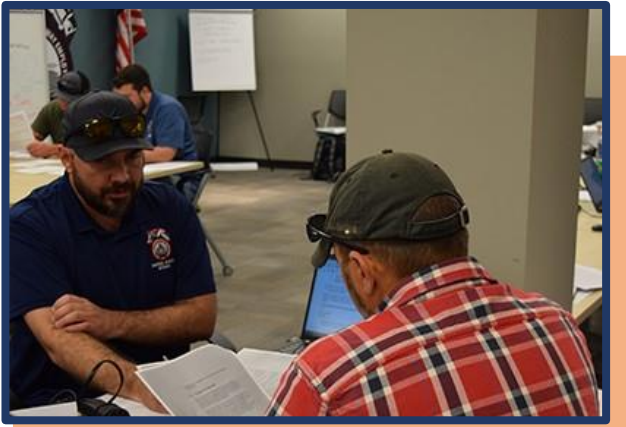
BMWED officers in training, April 2023

A standing committee elected under our Bylaws, the Audit Committee is composed of at least three (3) members in Good Standing who review and approve the Quarterly Audit Report prepared by the Lodge Secretary– Treasurer.