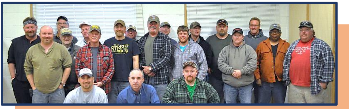
BMWED Lodge 1481 meeting in 2013.

In the US Army there's an old saying that the commander is responsible for everything their unit does or fails to do. In the US Navy, the ship captain is always responsible, even if he or she isn't While our Lodge Presidents may not be the most visible officers in our union or do the day-to-day work that generates the most interest among our members, they are the authorized leader within our union for coordinating all the action at the Lodge level and ensuring it gets done!