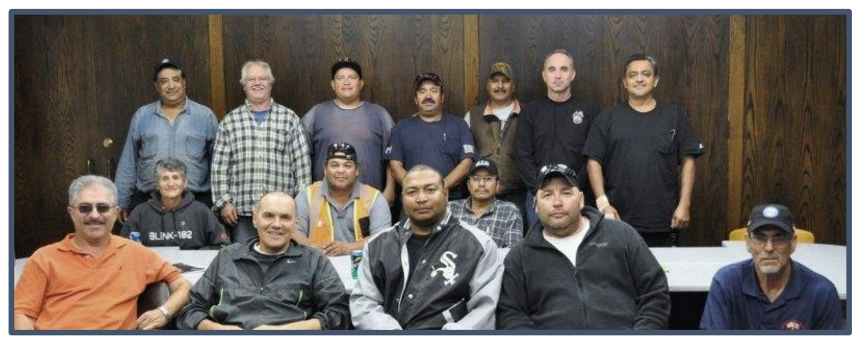
Burlington System Division Lodge 42, Chicago, IL, 2012

You can find their contact information at https://www.bmwe.org/directory.