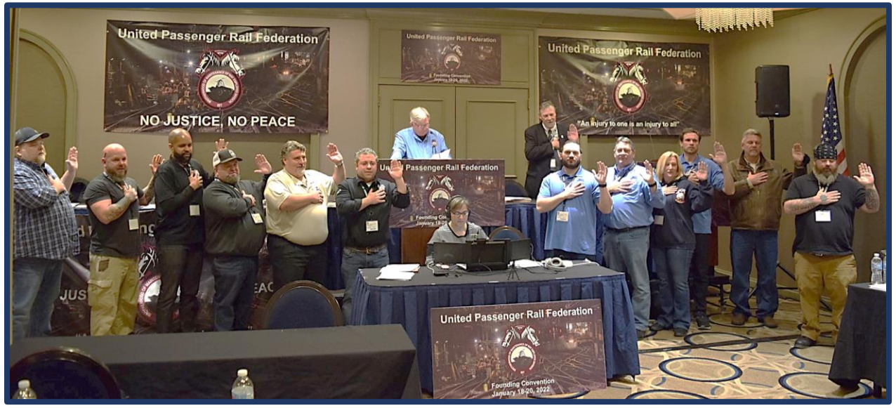
Officers of BMWED's United Passenger Rail Federation being installed after their election

For those Lodge officers provided under our BMWED Bylaws, each Lodge will hold elections to fill vacancies. Refer to Article XVIII or our BMWED Lodge Elections Guide for more information on how to conduct successful and effective Lodge Elections.