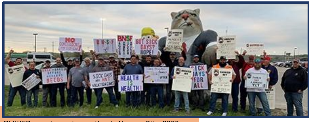
BMWED members at an action in Kansas City, 2023

Each System Division or Federation operates their Grievance Committees in a way uniquely suited to the needs of their members and in defense of their on-property agreements. In a nutshell the Grievance Committee is the first level of the BMWED Protective Department in preserving our collectively bargained rights.