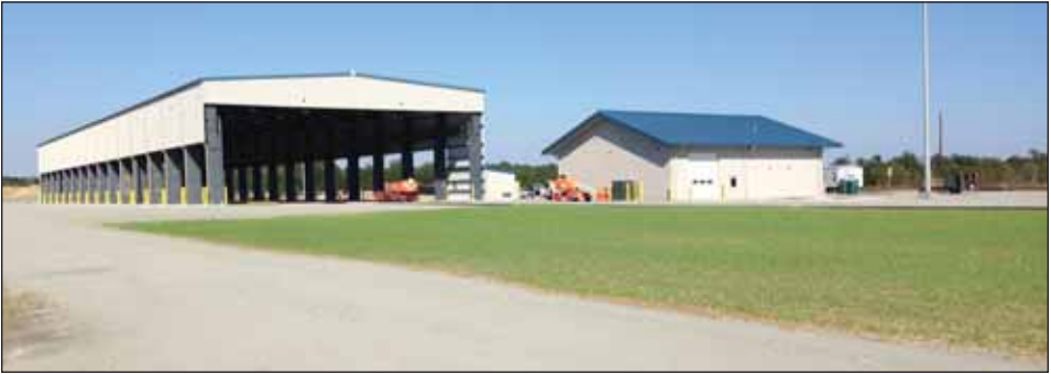
The CSX switch panel facility in Hamlet, N.C. (above) has employed 18 BMWED members since last November.

A full year after opening its doors, the CSX switch panel plant in Hamlet, N.C. is producing an average of two turnouts per day with BMWED-represented members. The turnout facility, which employs 18 BMWED members, plus two managers, will build over 300 switches in 2014, according to the carrier's numbers. Before opening the plant on Nov. 22 of last year, CSX bought its switch panels from contractors. The majority of the 18 employees brought on to work in the Hamlet facility were new hires and added to the BMWED seniority roster. "The hard work and skill our members exhibit everyday at the Hamlet switch panel plant is first-rate and we remain proud to call them our Brothers," BMWED Vice President of the South Region Roger Sanchez said. "It is excellent that CSX officials and the officers of the BMWED could come together and ensure that more track work, in this case the construction of switch panels, would be performed by union labor. We are proud to represent these fine railroaders."