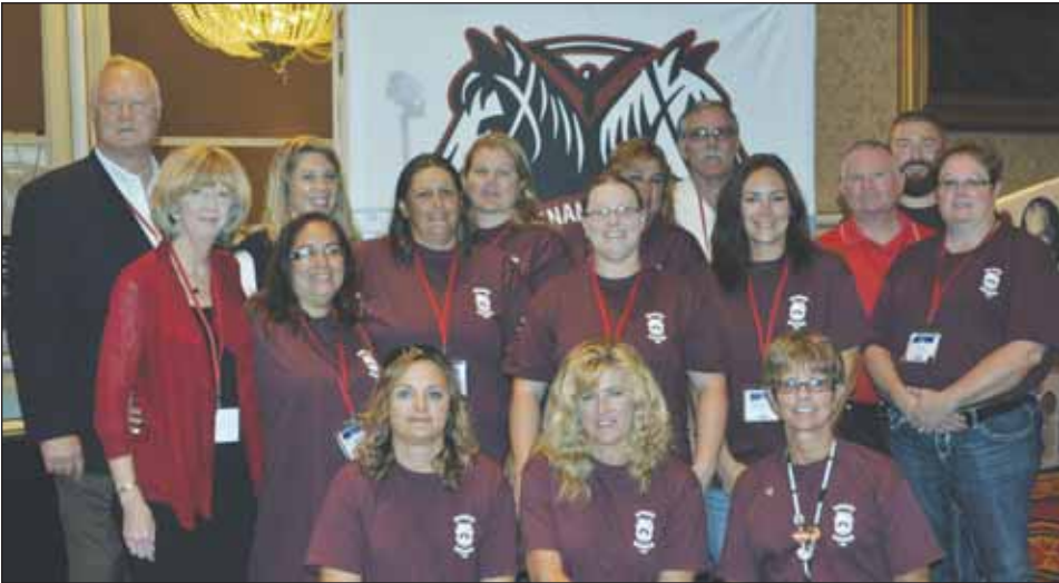
The BMWED sent 10 female members to this year's IBT Women's Conference in Chicago, a record attendance for our union.