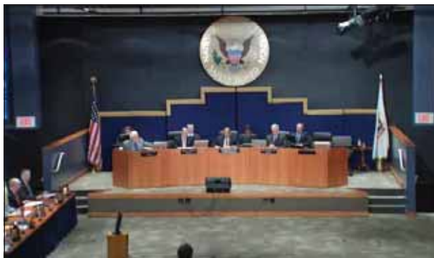
The NTSB held a special investigation on rail worker safety in light of a spate of worker fatalities in 2013, with a goal of eliminating such tragedies.

NTSB’s investigative report then overviewed the 15 roadway worker fatalities, discussed the circumstances of each fatality, and emphasized