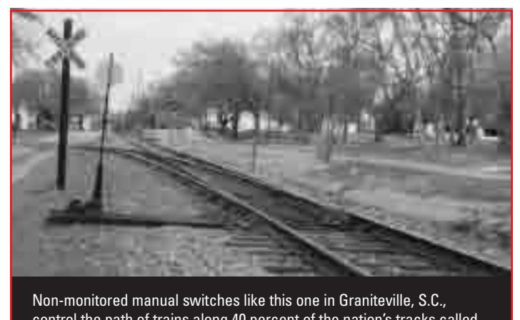
control the path of trains along 40 percent of the nation's tracks called 'dark territorv.'

Q: Are you "qualified" to inspect track under FRA Track Safety Standards?