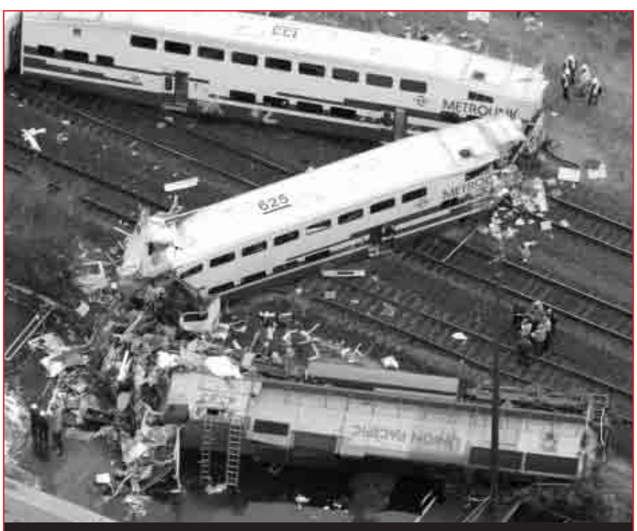
Freight and commuter railroads often share or run on parallel track, posing serious concerns for passengers. In a fatal January 2005 accident in Glendale, California, a Metrolink communter train struck a vehicle, derailed and sideswiped a freight train.

"Anyone can enter. The yard has a lot of crime take place in it. I assume a terrorist wouldn't have any problems here."