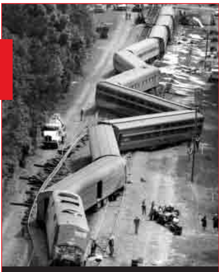
Rail workers say the infrastructure of the rail network is vulnerable, providing opportunity to terrorists. Rail crossings, some say, are particularly susceptible to attack, citing a frightening number of deadly crashes. In May 2003, a truck driver was killed and an Amtrak engineer critically injured when the train collided with a lumber truck in Hinesville, Georgia. The train carried 150 passengers and 14 crew members.

"Hunter Yard is not protected," said an Amtrak